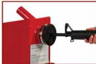
Safety Cover with Clamp

Every unit is constructed with fully welded steel bodies, from 1/4" thickness in the Model GT to 3/8" thickness in the Model GD to a beefy 3/4" thickness in the Model GHD. Inside each model is the patented Deceleration Chamber to safely and "cleanly" capture spent ammunition. The Deceleration Chamber contains a mixture of water and Snail Lube (a 100% aqueous biodegradable solution) to capture lead dust and protect both employees and the environment! Whatever your needs, there is a model available to perform