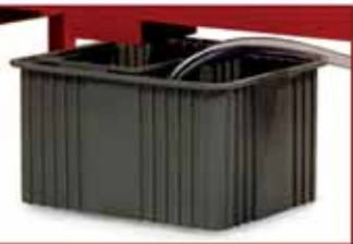
Fluid Containment and Retrieval Basket

use. A pump circulates the fluid through the spray bar to lubricate the ramps and the Deceleration Chamber. A tray sits below to capture spent rounds, and there is a side access door for internal inspection. If desired,